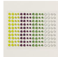
Transparent Adhesive Backed Dots [163432] $11.00