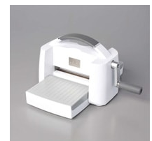
Stampin' Cut & Emboss Machine [149653] $177.00