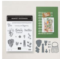
Market Goodness Bundle (English) [163429] $49.50