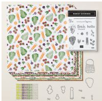
To Market Suite Collection (English) [163433] $77.50