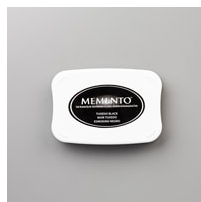
Tuxedo Black Memento Ink Pad [132708] $11.00