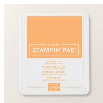
Peach Pie Classic Stampin Pad [163810] $12.25