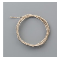
Linen Thread [104199] $7.00