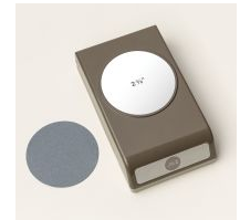
2 3/8" (6 Cm) Circle Punch [161354] $32.00