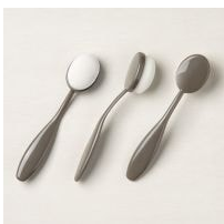
Blending Brushes [153611] $21.00