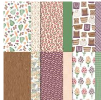
To Market 12" X 12" (30.5 X 30.5 Cm) Designer Series Paper [163421] $17.00